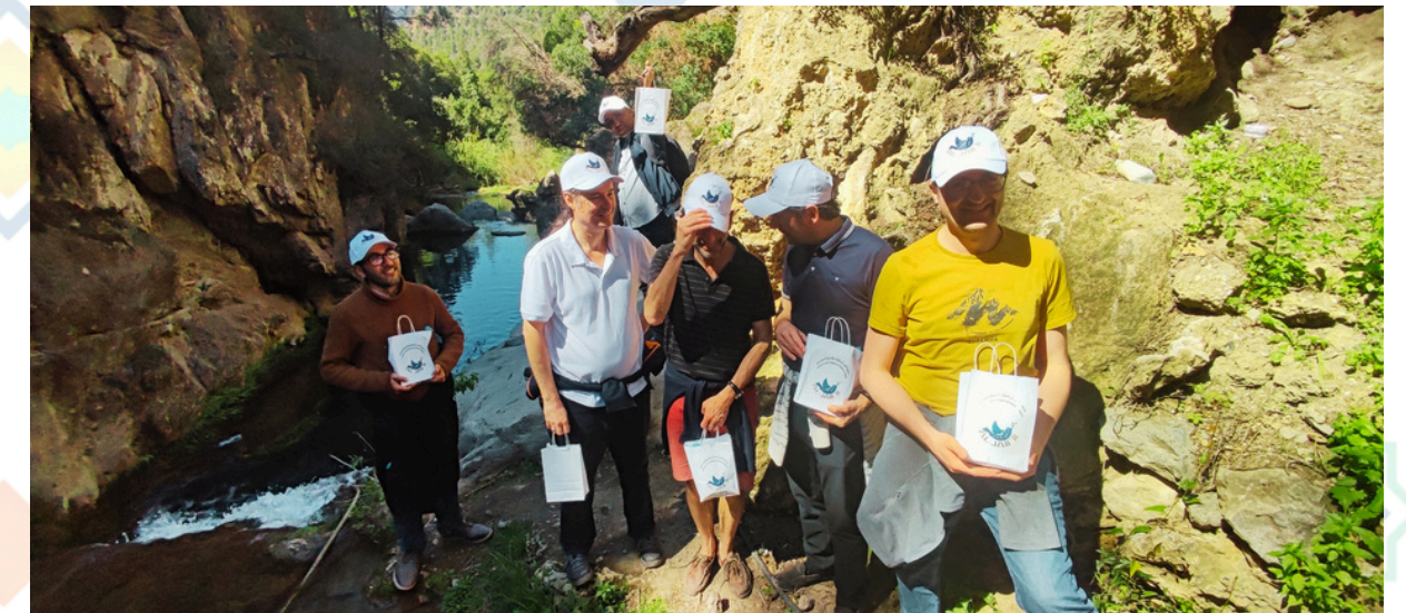
Cultural Touristic Trip